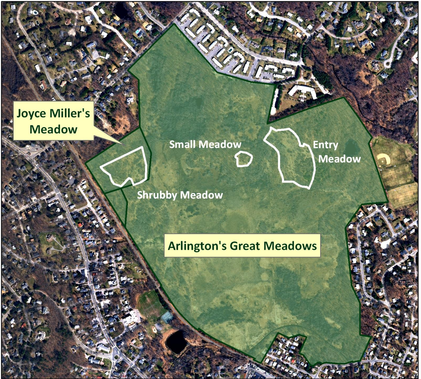
Map 1 -- Early Successional Areas Arlington's Great Meadows Vegetation Management Plan