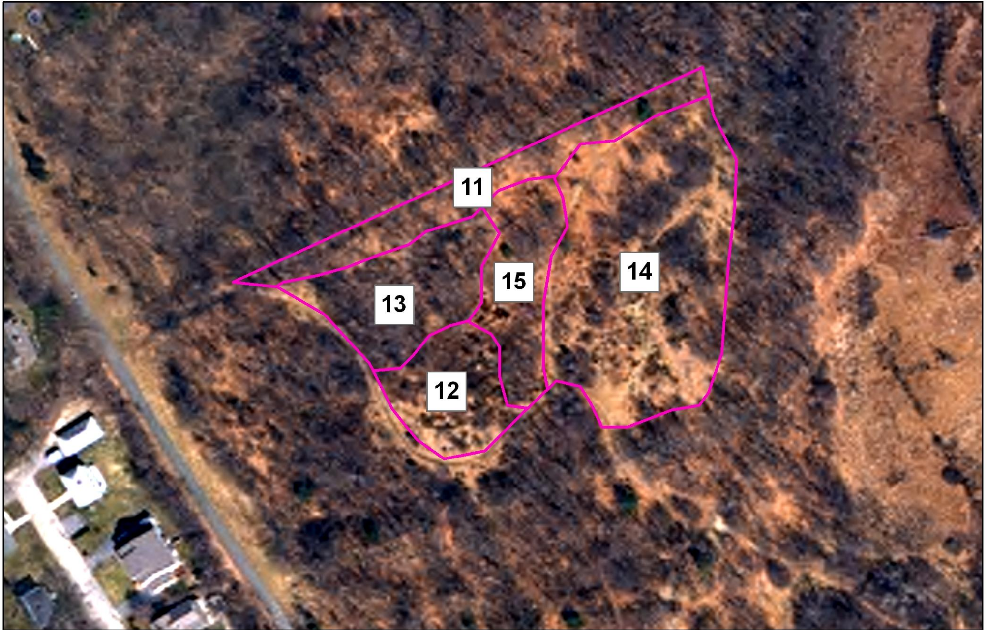
Map 3 -- Shrubby Meadow Arlington's Great Meadows Vegetation Management Plan