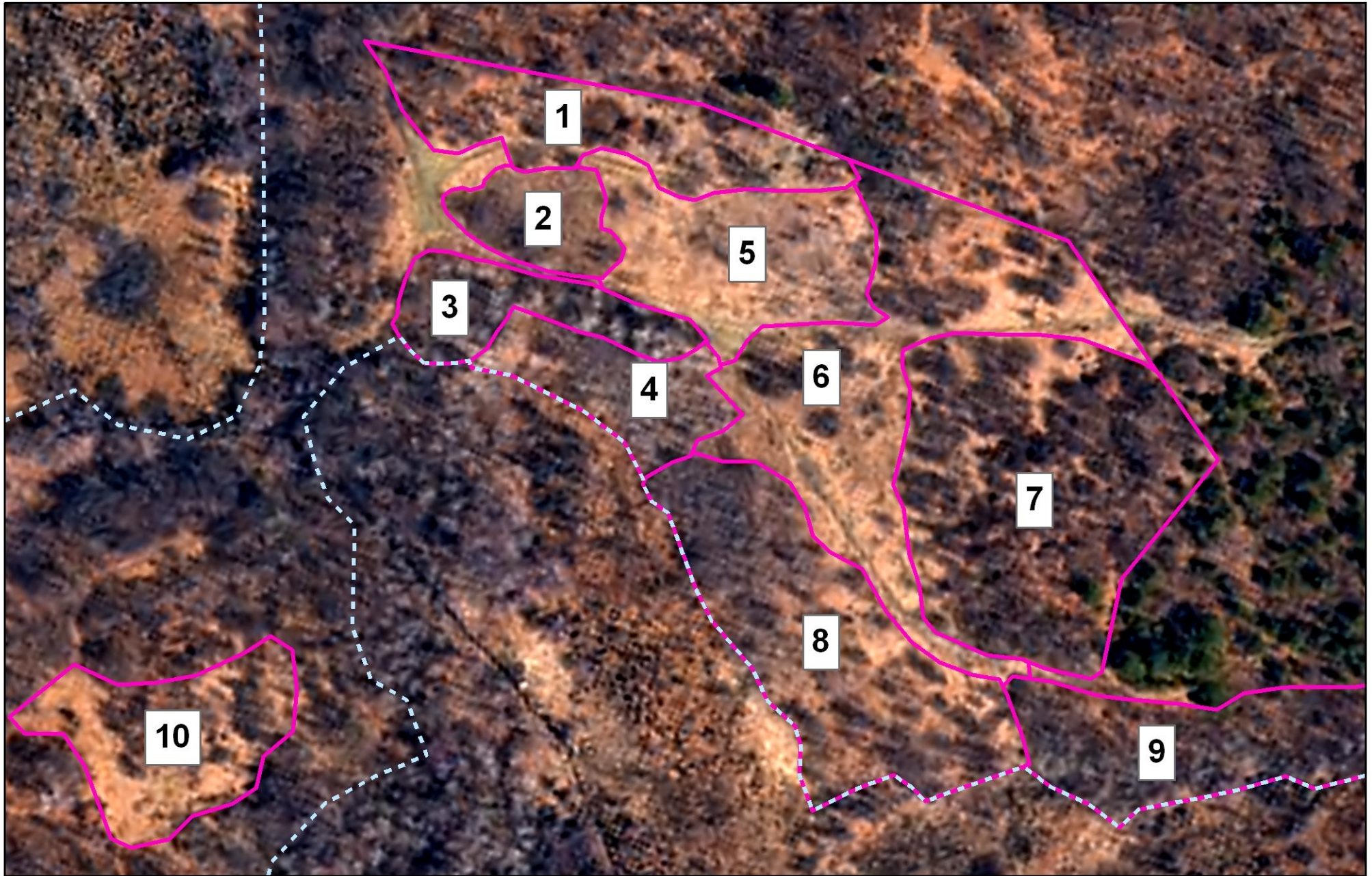
Map 2 -- Entry Meadow & Small Meadow Arlington's Great Meadows Vegetation Management Plan